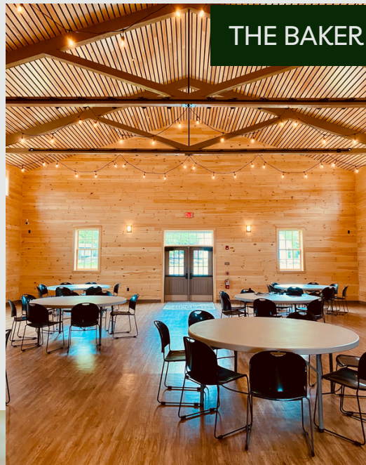
THE BAKER CENTER

The Baker Center is our largest rental space at 1,600 sq ft. This room is equipped with two Smart TVs and has direct patio access.